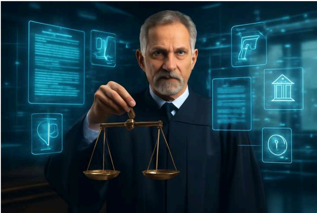
Futuristic representation of AI reshaping the legal profession

AI is not replacing lawyers, rather it is slowly replacing inefficiency in the legal system! The legal profession is undergoing a radical transformation. All thanks to Artificial Intelligence (AI) where a futuristic concept has enhanced the concept of law with intelligence. But now, it is at the heart of legal innovation that is redefining - how lawyers work, clients interact, and justice is delivered. Far from replacing human lawyers, AI is becoming an indispensable tool that enhances - efficiency, reduces costs, and opens new frontiers in legal service delivery.