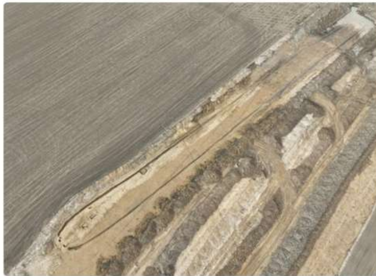
The 620-foot-long prehistoric burial mound unearthed in the Czech Republic during excavations along the route of the D35 highway. The funerary monument is thought to date to the 4th millennium B.C.